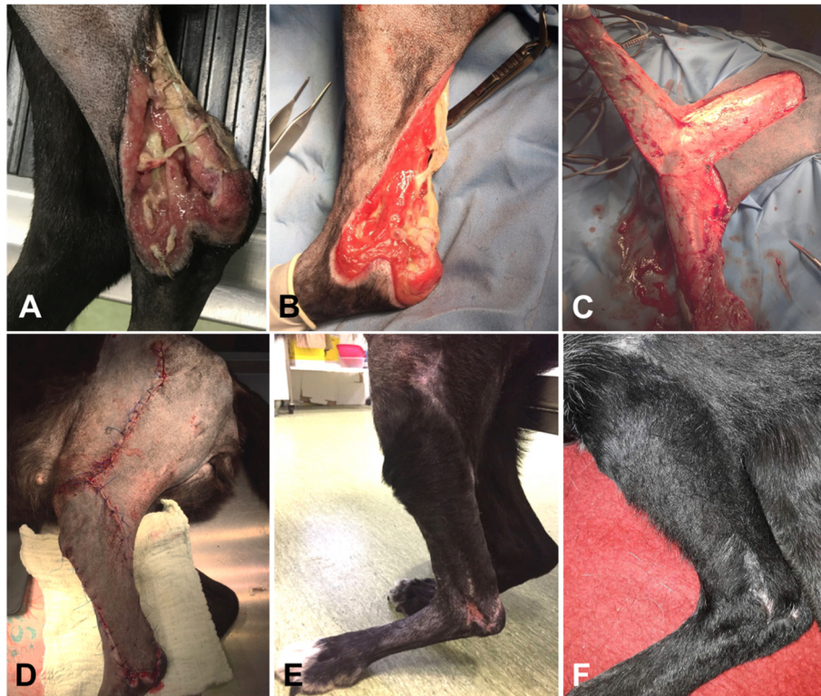
Fig. 2 Large open wound at the level of left lateral distal tibia ( a ) in a 14-year-old spayed female mixed breed; inflammation, edema, and necrosis of periwound skin are present. b Recipient bed prepared for flap closure. c Elevation of the flap. d Closure of the donor bed and immediate postoperative appearance of the genicular axial pattern flap. e Small dehiscence several days after breakdown at the tip of the closure. f Complete healing and hair growth after 2 months postoperative

adequate. General condition of the dog was very good, and score 2 lameness was present on the affected limb. CBC and serum biochemistry values were all within reported reference ranges at the time of surgery. The wound was surgically debrided and managed open with foam dressings containing dextrans, alginate and silver coating until a recipient bed of granulation tissue was achieved (Fig. 2b). Several millimeters of skin bordering the recipient bed were removed with a scalpel blade until a proper granulation bed was formed. Wound bed tissue samples were obtained for culture and sensitivity testing.