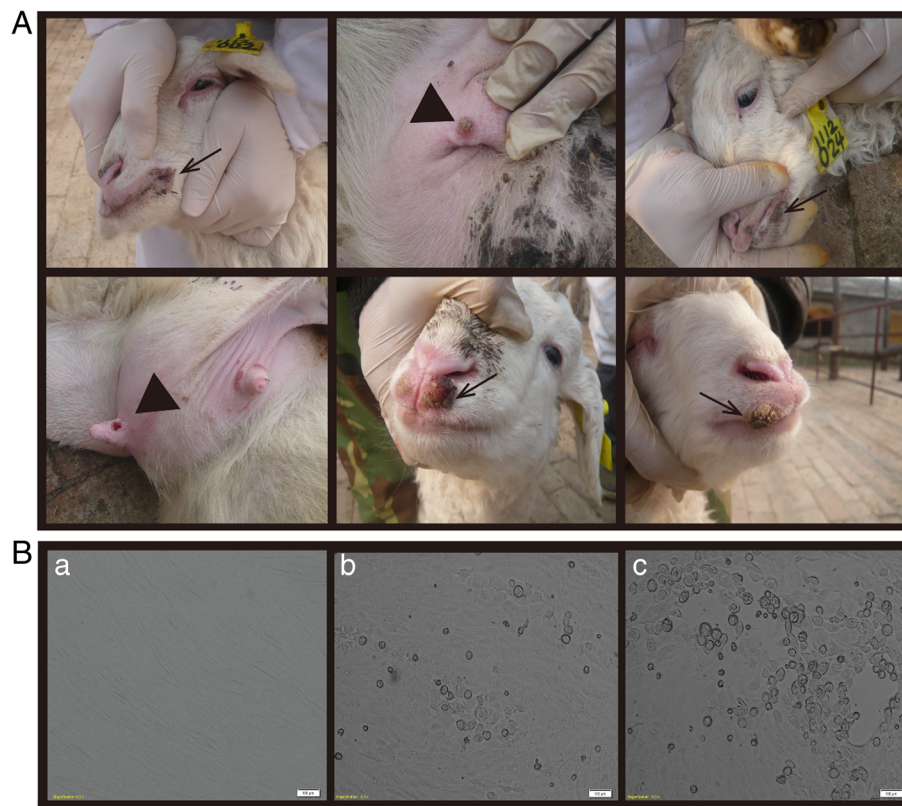
Fig. 1 Typical clinical signs of orf virus infection in sheep and OFTu cells. a Skin lesions of 6 infected sheep. Typical proliferative lesions on the skin of nostrils (arrows), nipple and mouth (Triangular arrowheads). b Cytopathic effect (CPE) of ovine fetal turbinate (OFTu) cells infected by orf virus strain HN3/12. a Uninfected OFTu cells b ORFV-HN-WY in OFTu at six days p.i. c ORFV-HN-WY in OFTu at eight days p.i. Scale bars = 100 \mu m

sequence data showed that they were ORFV sequences. ORFV011 and 059 nucleotide sequences of each sample were identical, indicating that the pathogen of the epidemic disease is the same as on the sheep farm. The HN3/12-011 and 059 sequences were edited, aligned, and uploaded to GenBank with the following accession numbers: KC569750 ( ORFV011 ) and KC569751 ( ORFV059 ).