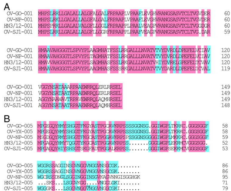
Fig. 4 Amino acid sequence alignment of ORF001 and ORF005 coded by five ORFVs. Multiple alignment was performed by Clustal Omega (available at http://www.ebi.ac.uk/Tools/msa/clustalo/ ) and DNAMAN software. Five ORFV strain accession numbers are shown in Table 2. The pink box indicates 100% ID of amino acid sequence among five ORFV strains. The cyan box indicates >50% ID of amino acid sequence among five ORFV strains

development of lesions induced by ORFV [32] (Additional file 1: Table S1). However, the functions of some proteins, such as ORFV001, 005, 116, 120, are still unknown, and require further exploration.