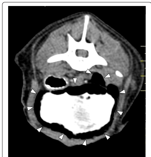
Fig. 1 Computerized tomography of the bladder. Legend: Gas was visualized on the inner side of the bladder wall (white arrowheads). Urine contrast was enhanced by an imaging agent

Susceptibility testing was performed by E-test (bioMérieux, Marcy l’Etoile, France) per the manufacturer’s directions against the following antimicrobials: ampicillin, amoxicillin/clavulanic acid, cefoxitin, imipenem, clindamycin, tetracycline, chloramphenicol, enrofloxacin, and metronidazole. Briefly, an inoculum was prepared by suspending a 48-h culture in reduced Brucella broth (Becton Dickinson Microbiology Systems, Cockeysville, MD, USA) to achieve a density of 1.0 on the McFarland nephelometer standard. The inoculum was plated on Brucella blood agar (bioMérieux Co., Ltd.). Minimum inhibitory concentrations (MICs) were determined following a 48-h incubation at 35 °C in an anaerobic chamber in accordance with Clinical and Laboratory Standards Institute guidelines [9]. Bacteroides fragilis ATCC 25285 was used as a reference strain. The bacterium showed high susceptibility to ampicillin, amoxicillin/clavulanic acid, cefoxitin, imipenem, clindamycin, tetracycline, chloramphenicol, and enrofloxacin, but was resistant to metronidazole (Table 1).