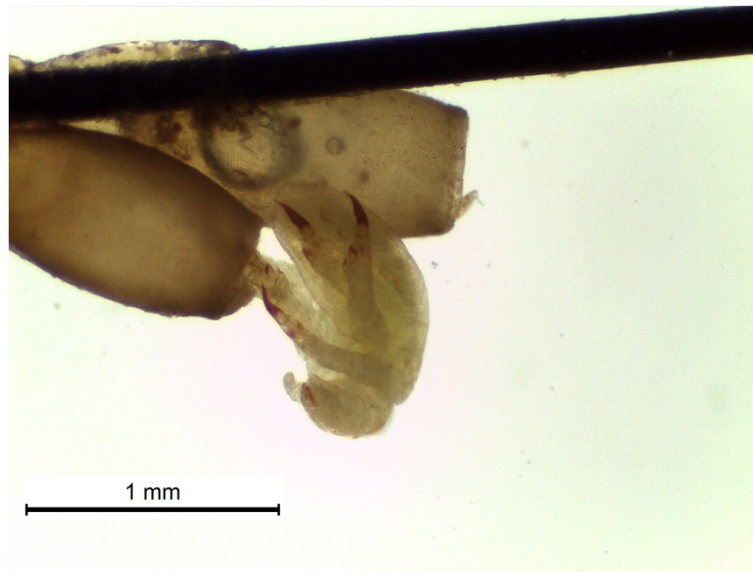
Figure 2 Haematopinus tuberculatus : hatching phase of a nit with the emergence of a nymph.