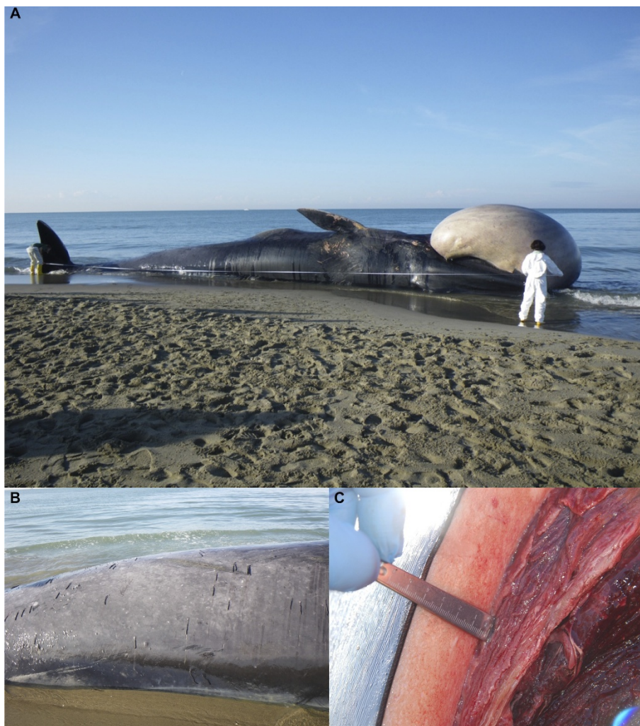
Figure 1 Steps of the necropsy carried out on the stranded whale. Biometrical measurements were taken before starting post-mortem analyses (A). A severe cutaneous parasitic infestation by Pennella spp. (B) was evident during external examination and a poor body condition was assessed due to a reduction of the blubber layer (C).

Masson's trichrome, Gram). Microbiological, immunohistochemical and biomolecular investigations for the main cetacean pathogens ( Morbillivirus , Herpesvirus , Brucella spp., and T. gondii ) were also performed on all major organs. Specifically, we utilized RT-PCR techniques targeting a highly conserved Morbillivirus nucleoprotein gene sequence (amplicon size 287 bp) and PCR techniques amplifying a conserved region of the nss-rRNA gene (approximately 300 bp in size) of coccidian parasites (Apicomplexa). Furthermore, immunohistochemical labeling for Morbillivirus and T. gondii antigens was attempted on molecularly positive tissues [7].