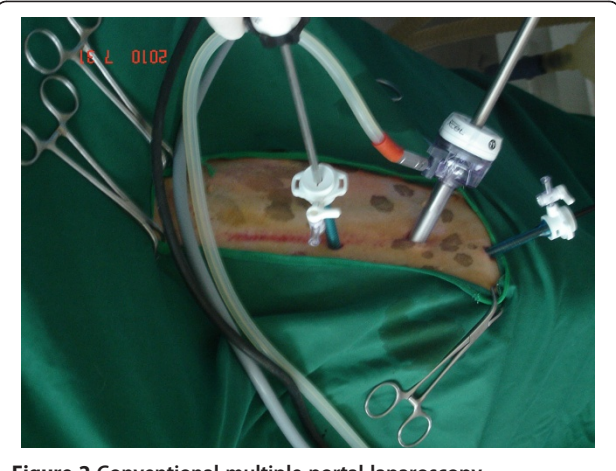
Figure 2 Conventional multiple portal laparoscopy.

The area from xiphoid to pubis was prepared under aseptic condition. Dog was placed in dorsal recumbency, head down and tilted 30 degree in the right lateral position. The surgeon and cameraman both stood on the right side of the dog and monitor was placed on the opposite side. For dogs operated by SILS method (n = 12), 3 cm midline skin incision starting from umbilicus to the caudal was made and the subcutis was reflected until revealing the linea alba. The linea alba was incised and the umbilical single portal was inserted using 5 mm TriPort trocar (Advanced Surgical Concepts, Wicklow, Ireland; Figure 1). For dogs operated by conventional method (n = 6), 3 portals including umbilical, cranial and caudal were inserted, 3 cm apart in a straight line, using 5 mm trocars. In both methods, the length of umbilical incision was enlarged, with routine surgical technique, according to the size of spleen (Figure 2). Pneumoperitoneum was established by CO<sub>2</sub> using an automatic high flow pressure until the pressure of 12 mm Hg was achieved. A 5 mm in diameter 30 degree rigid telescope (29 cm length, Wolf, Germany) connected to a light source was inserted into the peritoneal cavity from the umbilical portal. The orientation of the spleen and the location of its proximal and distal poles were located initially. The 5 mm curved flexible-tip Maryland forceps (Carl Storz, Germany) was introduced from the cranial port and inserted through the splenic vessels at the hilum to lift the