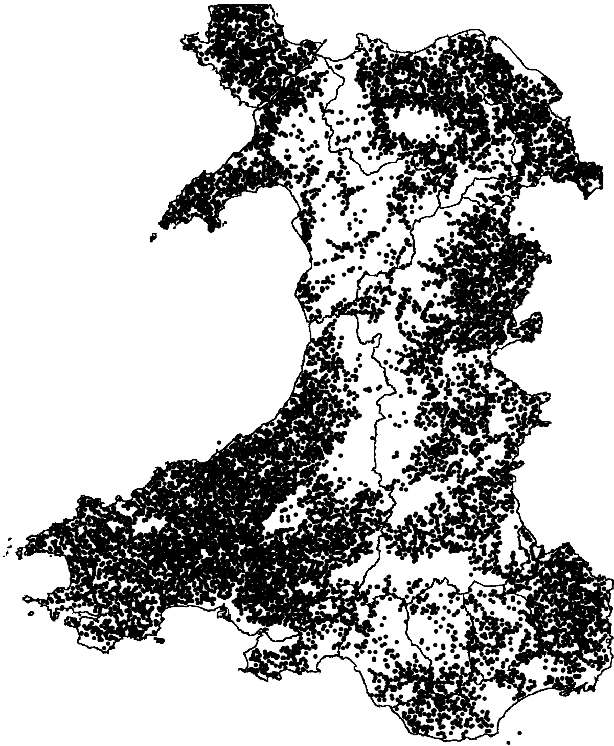
Figure 1 Location of the holdings in the study population.