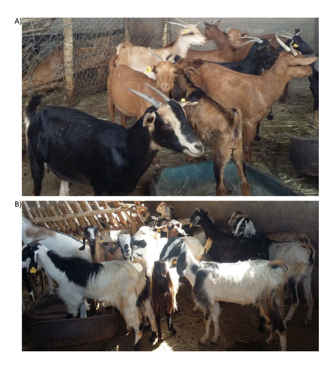
Fig. 3 Some figurative description of the type of breeds in the farm: A) Abergelle goat breed type B) Begait breed goat type

household reported a significant loss of 20 goat kids due to abortion. Heat stress and drought were reported as primary cause of abortion by most farmers with only seven mentioning physical trauma. The hot season emerged as the highest risk period, mentioned by 25 times respondents. Notably, the first trimester (44.8%) was identified as the most vulnerable pregnancy stage for abortion, followed by the third trimester (34.50%). Regarding the consequence on does, difficult birth and decrease milk production were reported most frequently (each 31.0%), followed by placental retention (17.20%). Interestingly, 65.50% of respondents believed goats experiencing their first pregnancy (first kidding) were at higher risk of abortion. Awareness of potential zoonotic risks from contact with aborted animals was remarkably low (86.2%), with only four household expressing concerns. Additionally, our corresponding author (Guash Abay) observations, along with reports from farmers and experts, suggest that