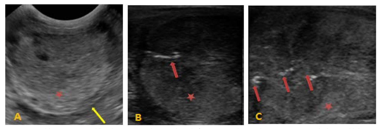
Fig. 2 A Normal, homogeneous, mildly echogenic testicular parenchyma before intratesticular zinc gluconate treatment in donkey. B Mild changes in testicular echotexture after zinc treatment (30 days) characterized by few hyperechogenic areas (red arrows) throughout the parenchyma (red star), yellow arrows (tunica albuginea of testis). C Marked changes in testicular echotexture after zinc treatment (60 days) characterized by marked hyperechogenic areas (red arrows) throughout the parenchyma (red star), yellow arrows (tunica albuginea of testis).

Before intra-testicular zinc gluconate injection, ultrasonography of the scrotal contents revealed homogeneous and mildly echogenic testicular parenchyma with no abnormalities in the epididymides, testes, or spermatic cords (Fig. 2A). However, at the