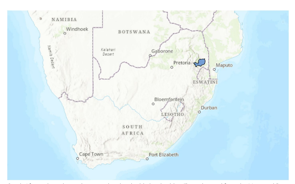
Fig. 1 Study area in South Africa, where the study was undertaken highlighted in blue (Data obtained from the Municipal Demarcation Board and map drawn in ArcGIS—https://spatialhub-mdb-sa.opendata.arcgis.com/)

tabulated as a percentage of total responses. When fewer than the total respondents provided a response for a particular question, the percentage response was based on the count of the specific response in comparison to the total responses for that specific question. In these cases, the actual responses are presented in parenthesis (response/total response) adjacent to the percentage response.