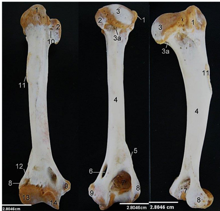
Fig. 2 Lion Humerus, Cranial, caudal and lateral views. 1, Greater tubercle; 2, Lesser tubercle; 3, Head; 3a, Neck; 4, Body; 5, 12, Supracondylar crest; 6, Medial supracondylar foramen; 7, Olecranon fossa; 8, Lateral epicondyle; 9, Medial epicondyle; 10, Intertubercular groove; 11, Deltoid tuberosity; 13, Lateral condyle; 14, Medial condyle