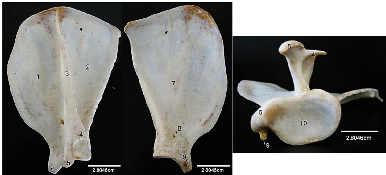
Fig. 1 African Lion Scapula, Lateral (A), medial (B) and ventral (C) views. 1, Supraspinous fossa; 2, Infraspinous fossa; 3, Spine; 4, Suprahumeral process; 5, Humeral process; 6, Post-glenoid tubercle; 7, Subscapular fossa; 8, Nutrient foramen; 9, Coracoid process; 10, Glenoid cavity