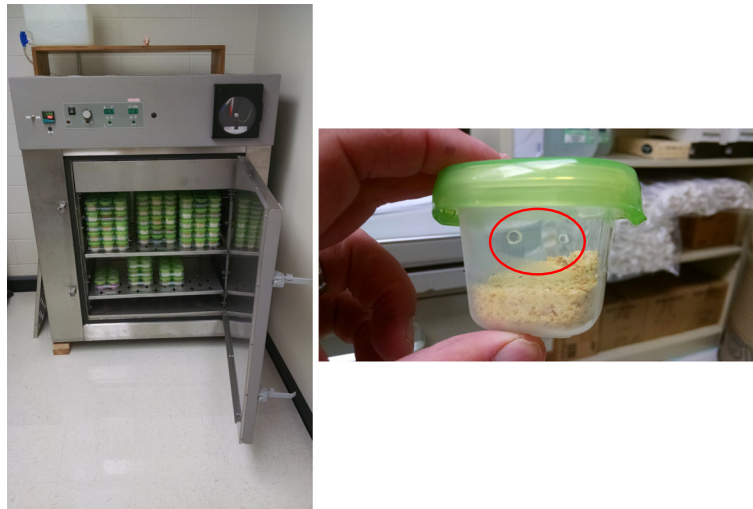
Fig. 1 Environmental chamber and sample containers. This figure depicts the environmental chamber loaded with sample containers as well as a close-up view of a container. Note the two 0.318 cm holes (red circle) drilled in the container to allow for contact of the ingredient with the chamber environment