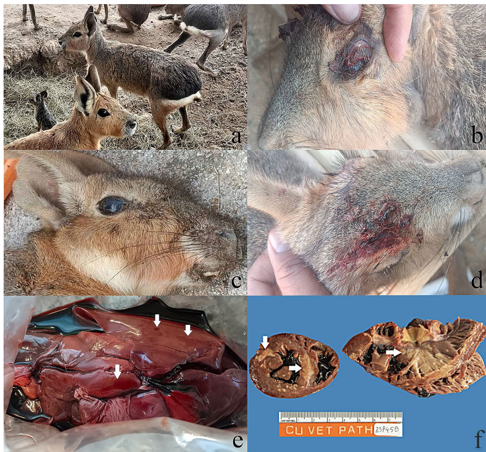
Fig. 1 (a) Patagonian maras raised in the farm. (b) Ocular hemorrhage in the sick mara. (c) Corneal opacity in the sick mara. (d) Subcutaneous bleeding in the sick mara. (e) Macroscopic lesion of hemorrhage (arrows) in the mara's liver specimen. (f) Multiple myocardial necrosis and calcification (arrows)

ARs can be divided into the first generation, such as warfarin, coumatetralyl and diphacinone and the second generation, such as bromadiolone, brodifacoum and difenacoum; the second generation of ARs has a higher binding affinity to hepatic tissues, therefore expresses higher accumulation, persistence and toxicity [8]. Both