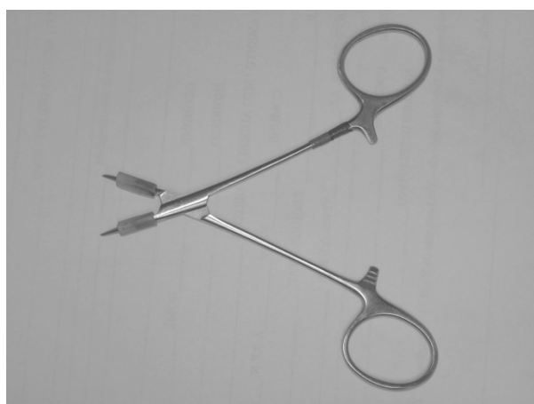
Figure 2 Two pieces of 5 mm latex tubing were placed around the jaws of a mosquito forceps.

an analog pressure gauge and a 50 ml syringe using a technique similar to a previously published study [15]. Briefly two pieces of 5 mm latex tubing were placed around the jaws of a mosquito forceps (Fig. 2). The intravenous catheter was partially fed along the internal trocar, so to protect tissue from its sharp tip (Fig. 3A). The catheter was then introduced into the artery that was then clamped with the modified mosquito forceps (Fig. 3B). A solution of methylene blue dye and water was injected through the catheter until ligature failure, as identified by loss in pressure or dye leakage [2,7,15]; maximal luminal pressure was recorded and compared between groups. When pressures reached 1050 mmHg, injection was stopped. The leaking pressure test was performed by two operators blinded to the specimens' group.