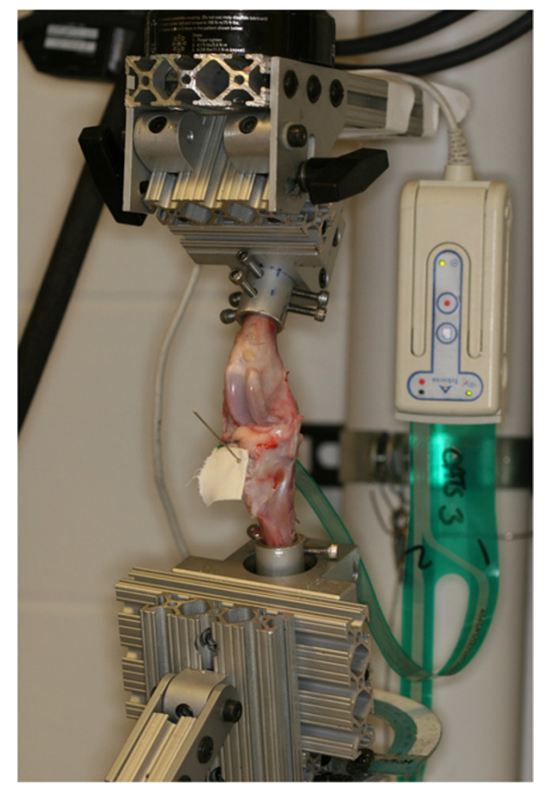
Figure 1 Illustration of the testing apparatus including stifle jig mounted in the material testing machine and digital pressure sensor positioned subjacent to lateral meniscus.

The lateral compartment was exposed by retracting the lateral collateral ligament, flexing and rotating the femoral condyles relative to the tibia. The sensor was