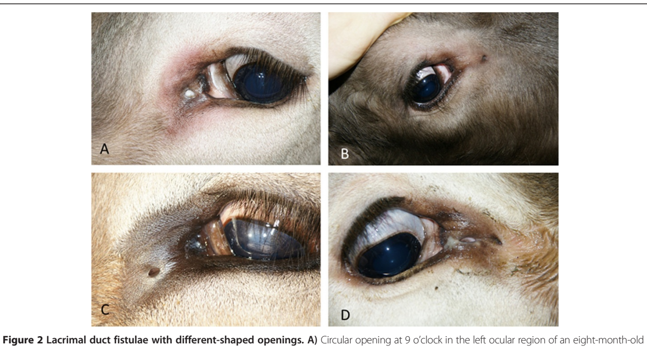
Figure 2 Lacrimal duct fistulae with different-shaped openings. A) Circular opening at 9 o'clock in the left ocular region of an eight-month-old daughter of bull A; B ) Circular opening at 4 o'clock, 3.5 cm from the medial canthus in the right eye of a four-month-old daughter of bull B; C ) Oval opening 1 cm medial to the medial canthus of the left eye in a two-year-old daughter of bull A; D ) Slit-like opening 1.1 cm medial to the medial canthus of the right eye in a two-year-old daughter of bull A; D )