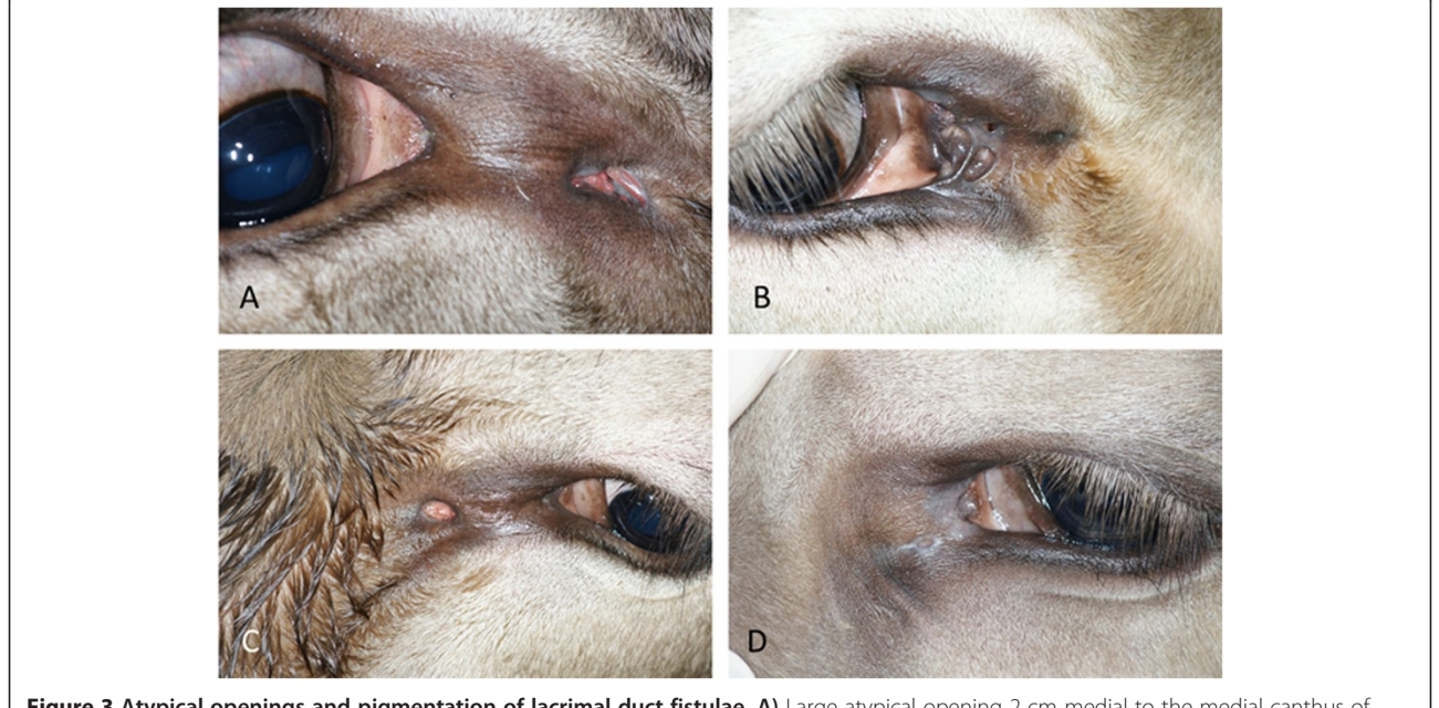
Figure 3 Atypical openings and pigmentation of lacrimal duct fistulae. A) Large atypical opening 2 cm medial to the medial canthus of the right eye in a two-year-old daughter of bull A; B : Severely abnormal medial canthus and several fistulous openings of the right eye a in a one-year-old daughter of bull A; C ) Nasolacrimal duct fistula with a pigmented oval opening in the left eye of a two-month-old daughter of bull A; D ) Nasolacrimal duct fistula with a non-pigmented oval opening in the left eye of a seven-month-old daughter of bull A.

Figure 2 Lacrimal duct fistulae with different-shaped openings. A) Circular opening at 9 o'clock in the left ocular region of an eight-month-old daughter of bull A; B ) Circular opening at 4 o'clock, 3.5 cm from the medial canthus in the right eye of a four-month-old daughter of bull B; C ) Oval opening 1 cm medial to the medial canthus of the left eye in a two-year-old daughter of bull A; D ) Slit-like opening 1.1 cm medial to the medial canthus of the right eye in a two-year-old daughter of bull A; D )